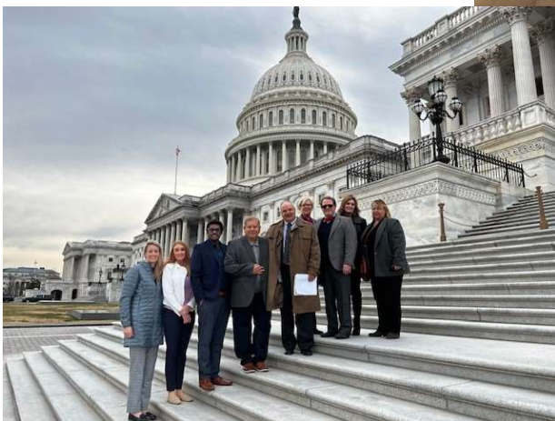
Citizens for Fort Campbell Advocacy trips February 2023 and 2024